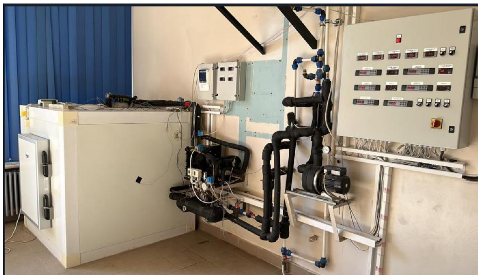
Fig. 1 - Overview image of the experimental setup

The system (VCRs), in addition to the compressor, condenser, lamination valve and evaporator, also includes a heat exchanger (PCM-refrigerant discharged by the compressor), thermal energy storage through phase change. This thermal energy could be used externally for domestic water heating or within the scheme (inside) for evaporator defrosting. During defrosting, this thermal energy can be calculated (evaluated) because the equivalent of ice deposited on the evaporator (measured experimentally) that can be melted with this thermal energy is known. The installation works for 4 hours and during this time an amount of ice is collected, which is to be melted using an amount of PCM, then in 20 minutes the defrosting takes place. One of the major advantages of using PCMs in VCRs is their ability to reduce power consumption. Thus, energy consumption can be reduced if PCMs are used for defrosting. The potential use of PCMs in increasing the energy savings and COP of VCRs has also been highlighted in various scientific papers.